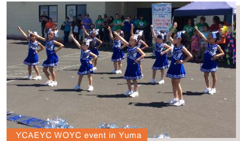
YCAEYC WOYC event in Yuma

In Yuma, the YCAEYC held a WOYC event on April 12th where 25 agencies and approximately 200 families participated. YCAEYC also had membership tables at local FTF events and conferences.