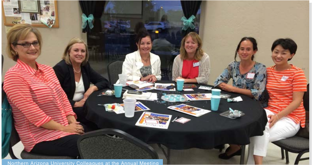
Northern Arizona University Colleagues at the Annual Meeting