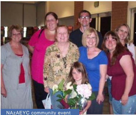
NAzAEYC community event

On October 25th, VSAEYC sponsored a professional development event for early childhood professionals aimed to increase knowledge and practical skills around early learning STEAM (Science, Technology, Education, Arts and Mathematics) education. Over 60 participants attended and enjoyed putting their newfound STEAM skills into practice!