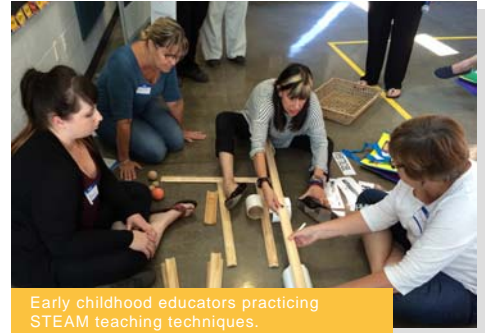
Early childhood educators practicing STEAM teaching techniques.

On October 25th, VSAEYC sponsored a professional development event for early childhood professionals aimed to increase knowledge and practical skills around early learning STEAM (Science, Technology, Education, Arts and Mathematics) education. Over 60 participants attended and enjoyed putting their newfound STEAM skills into practice!