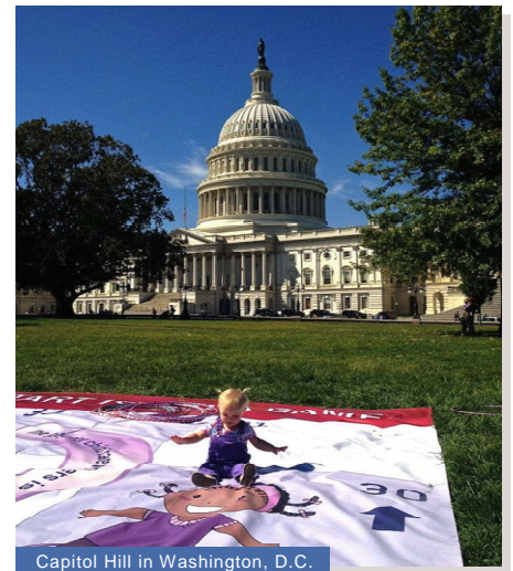
Capitol Hill in Washington, D.C.

We value leadership and advocacy in the field of early care and education.