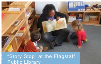
"Story Stop" at the Flagstaff Public Library

The Northern Arizona University (NAU) student chapter continues to hold several ongoing and annual activities. Every Saturday they conduct "Story Stop" at the Flagstaff Public Library. A selection of 3 or 4 good books with diverse developmental language interaction levels are read aloud, followed by literacy activities with materials parents have at home. As many as 8 - 25 individuals attend this event each week. It is a great experience for students and families.